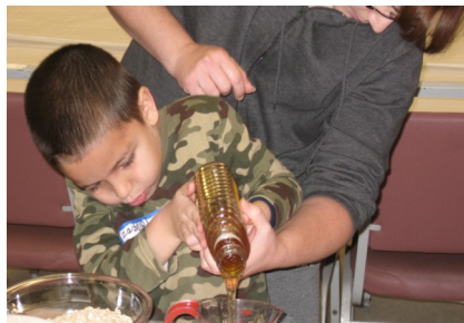
An eager program participant gets a helping hand during cooking class.

Special thanks go to the Junior League of Morristown for its recently completed series of family cooking programs that encouraged parents and children to have fun cooking together. Recipes included such favorites as "Healthy Pizza" and "Fun Fajitas", as well as helpful hints for using fresh vegetables and having "Breakfast Anytime." They also hosted demonstrations preparing family friendly meals and snacks.