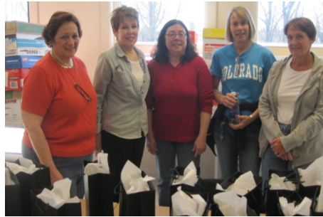
Employees of Solix helped us stuff Goody Bags for the Spring Gala.