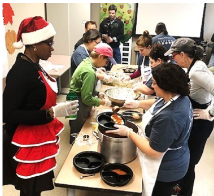
Employees from Benjamin Moore help to prepare home cooked meals.