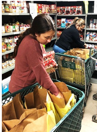
Employees of Marks Paneth Company help to pack Thanksgiving bags.

conducted food drives, that it's just impossible to mention them all in this limited space. But we do want to mention a few who made significant contributions of food and funds including Kings Food Markets, the Morris County Educators Association, Lexus of Route 10, New Jersey Association for Justice, Montville Unico/Turkeys 4 U, Notre Dame of Mt. Carmel Church, St. Vigil Church, Christ the King Church, Hilltop Church, UPS and our partners at the Community Food Bank of NJ . Thanks also to the many individual volunteers who "triaged" incoming food and put in hours of overtime sorting through it, and to all the groups