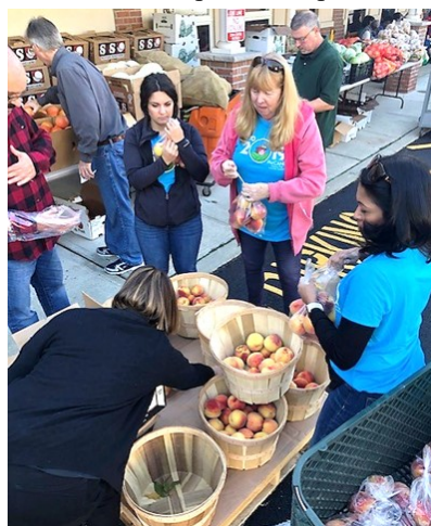
Employees from McCann's Health Managed Markets volunteer at the IFP Farmers Market assisting clients and packaging produce.

The Pantry was overflowing with fresh produce during the growing season this year. Many growers including home gardeners, community gardeners, CSA programs, non-profits, churches, schools, corporate gardeners, and local farmers donated over 62,000 pounds of produce to the Pantry. Thank you farmers and gardeners! A special thanks to our local farmers including Alstede Farms, Bader Farm, Crane Farm, Flying Triangle Organic Farms, Greystone Park Farm, Greenhouse and Nursery, Let It Grow Farm, Parks Farms, Serenity Farm, Sun Circle Farm, Sun High Orchards, Union Hill Farms, and Circle Brook Farm .