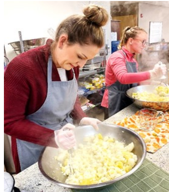
Members of the Junior League of Morristown help to prepare home cooked meals for our Home Delivery clients.