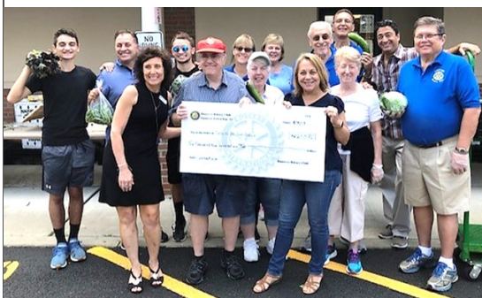
Hanover Rotary volunteers at IFP Farmers Market.

Each year we select one group and one individual to receive our highest volunteer honor, the Golden Apple Award , which is given to those identified as going above and beyond in their support of the Pantry and dedication to our mission. This year's Group Golden Apple award was awarded to the Hanover Rotary for their decades long support of the Pantry through