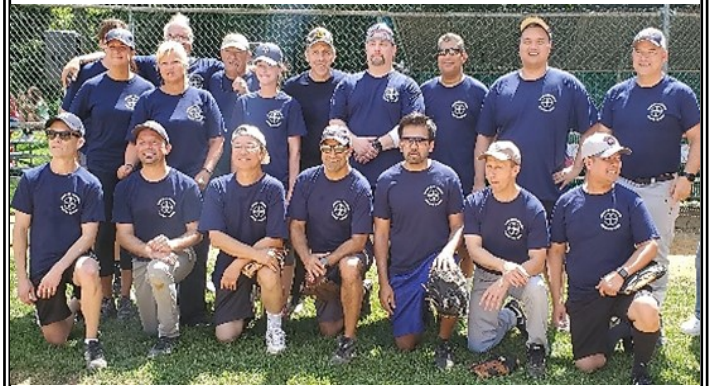
Bayer looks ready for the win... maybe next year!